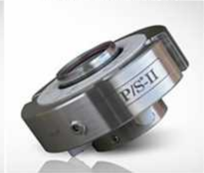
KLOZURE MECHANICAL SEALS