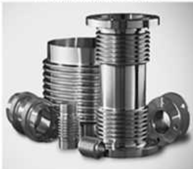
METAL EXPANSION JOINTS