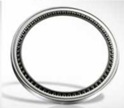
KLOZURE OIL SEALS